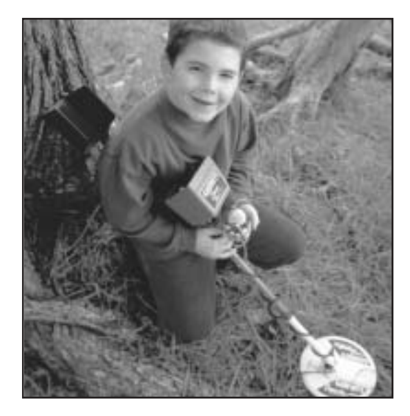
It's never too soon to begin the exciting hobby of metal detecting.

"Thank you for giving me a quality product that ensures quality time alone or with my children.."