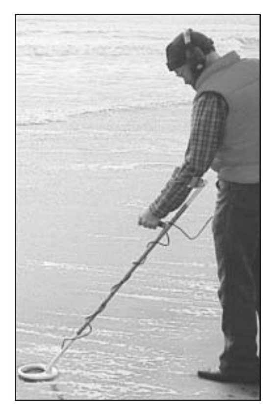
Find more treasure on the beach, in the surf, and at ocean depths with Garrett.