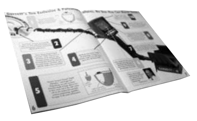
Up-close and personal; Garrett's Ten Exclusive and Patented Features.

9. Graphic Target Analyzer technology that provides continuous visual target information and accept/reject selections.10. GTI display that shows size of all targets in easy-to-understand graphics.